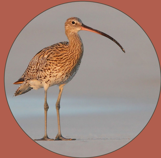
Eurasian curlew 200 Euro