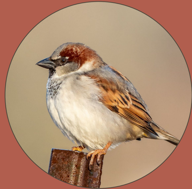
House sparrow 20 Euro