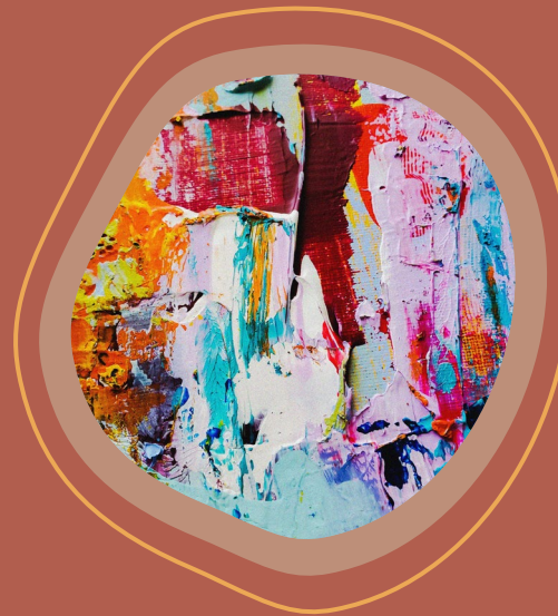
Colors and Fonts