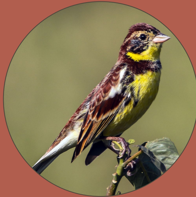
Yellow-breasted bunting 10 Euro