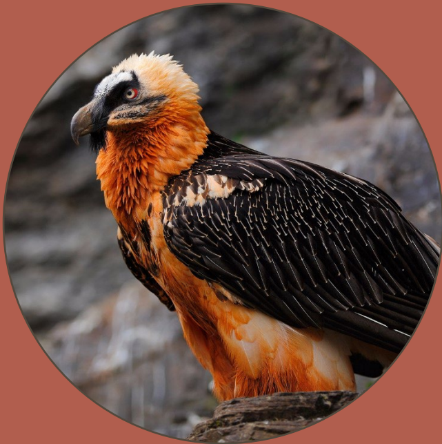
Bearded vulture 50 Euro