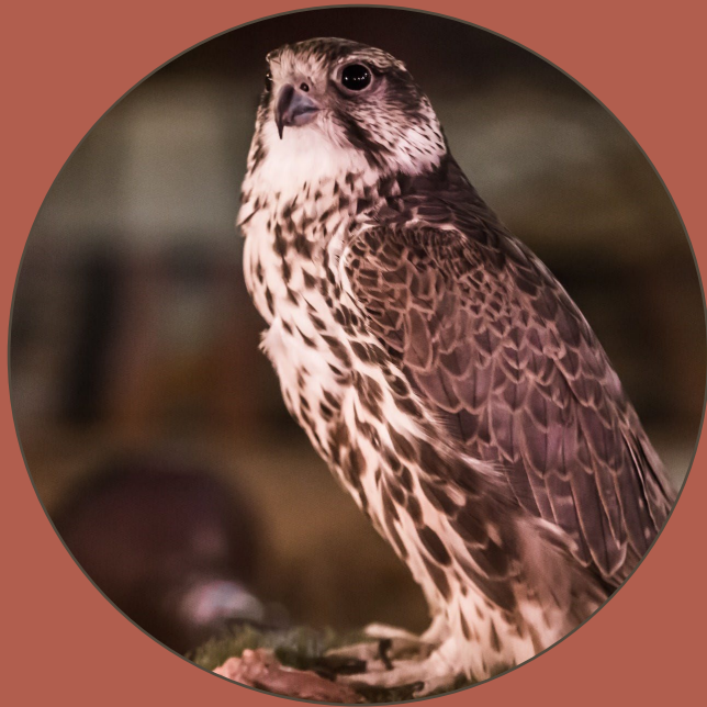
Saker falcon 5 Euro