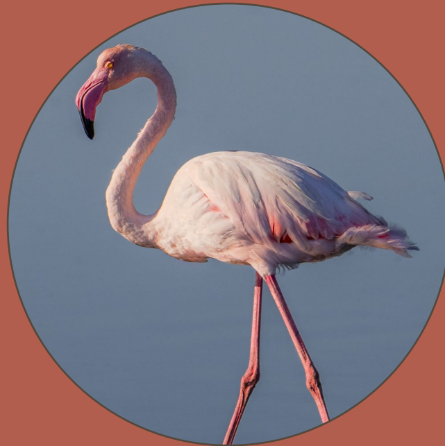
Flamingo 100 Euro